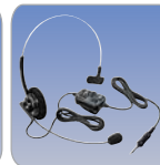
VC-24 VOX Headset