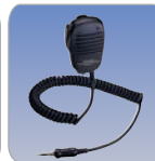
MH-57A4B Speaker/ Microphone