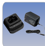
VAC-370B Rapid Charger