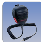
CMP460 Noise Canceling Waterproof Speaker/ Microphone