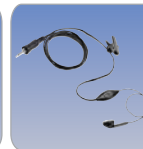
VC-27 Ear piece / Microphone