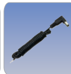
E-DC-6 12V Cable Without Adapter Plug