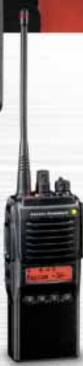
VX-924E 512 ch/32 groups with 4 Keys and LCD