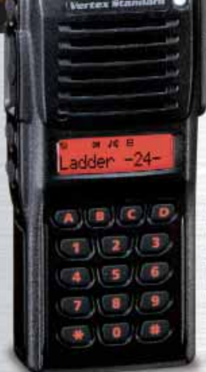
VX-929E 512 ch/32 groups with 16 Keys and LCD