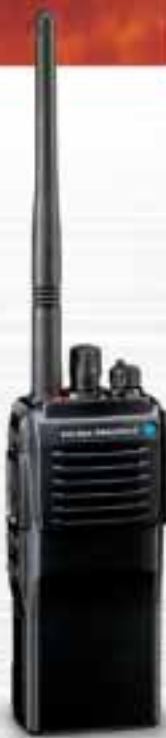
VX-921E 48 ch/3 groups without LCD